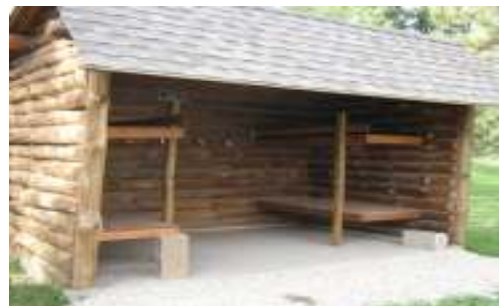
Adirondack Sleeping Shelter

Shower house/restrooms: Six individual showers and seven individual toilets with one handicap accessible. Open year round.